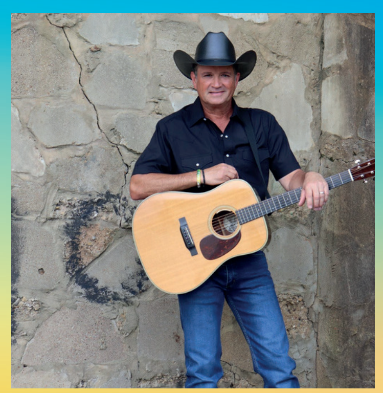
TRACY BYRD CONCERT